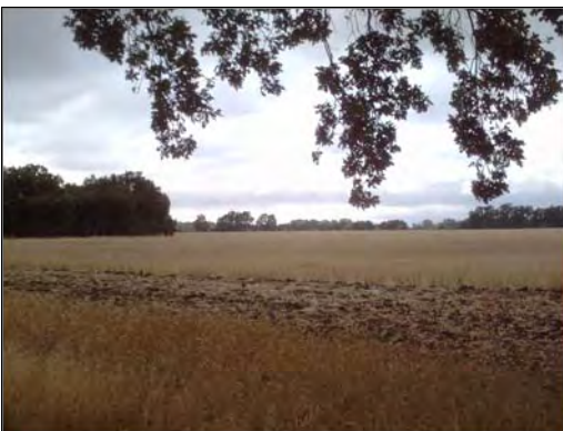
Llano Seco Agricultural Easement

On Friday, May 16, 2008 from 8:00 A.M. – 2:00 P.M. , NCRLT and Northern California Farm Credit will hold a free Farm Succession Workshop . This workshop is open to the public and to all ages and will take place on NCRLT's Llano Seco Rancho easement, approximately 15-miles SW