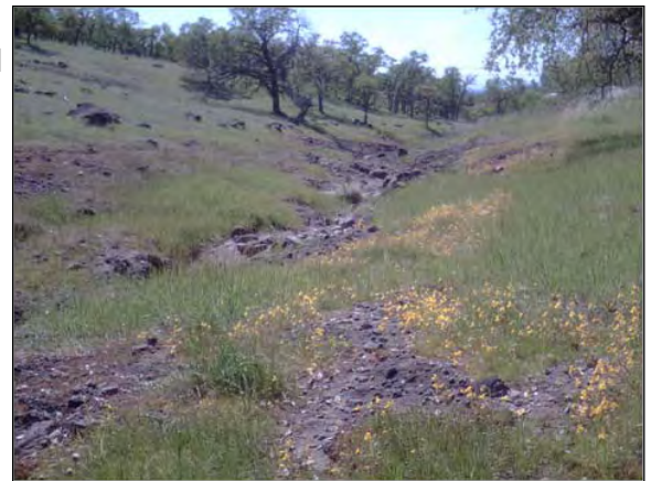
Blue Oak Woodlands in Butte County

rently available from the Department of Conservation (DOC) and Natural Resource Conservation Service (NRCS) Farmland and Ranchland Protection Program (FRPP).