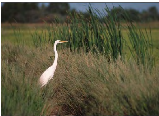
Common Egret near rice field

Two of the three properties assessed have since been approved for free appraisals, which are currently being contracted by NCRLT. In November 2007, NCRLT began its outreach campaign to farmers in the tri-county region. We have shared our presentation titled: “ Agricultural Conversion and Irrigated Farmland Protection in Glenn, Butte and Tehama Counties ” to over 350 people at Rotary Clubs, Resource Conservation Districts, Farm Bureaus and Grange Halls. We will